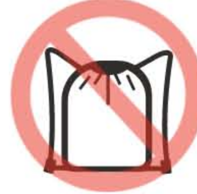
Solid color cinch bag