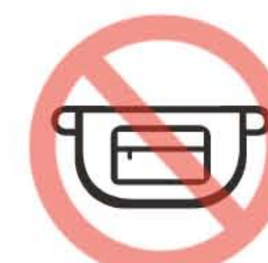
Large fanny pack