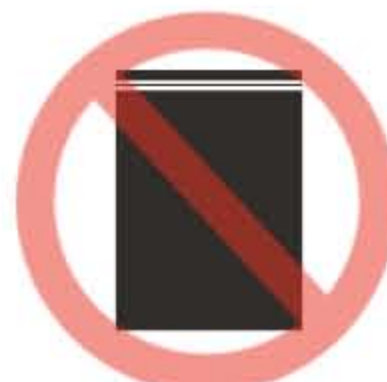
Colored plastic storage bag