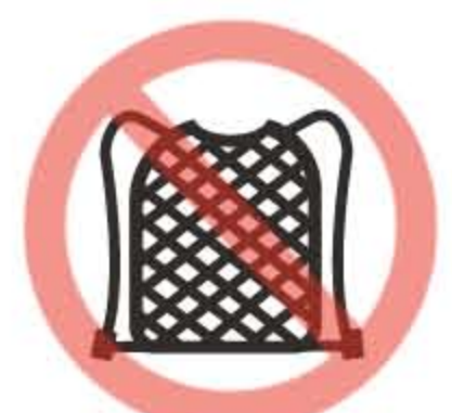
Mesh or straw bag