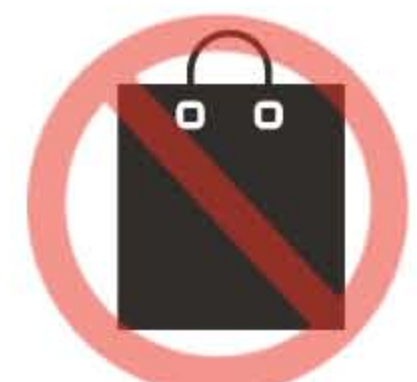
Large tote bag