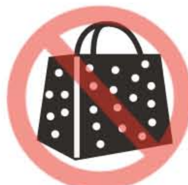
Printed patterned plastic bag