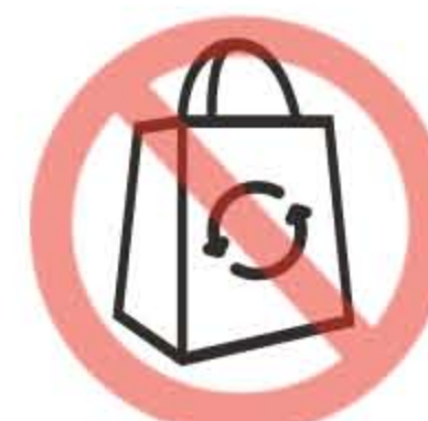
Reusable grocery tote